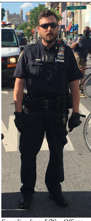
Sampling from 5/29 – Officer without masks, with covered badges and open disdain for the public.

We are told that it's just a few "bad apples" but have seen egregious behavior condoned by all levels of leadership. I have seen senior officers in white shirts stand by witnessing and, through their silence, permitting this behavior. I watched officers openly mock their colleagues for accepting a mask and speaking respectfully to protestors – and later saw an officer who was mocked overcorrect by lashing out in violence against the crowd.