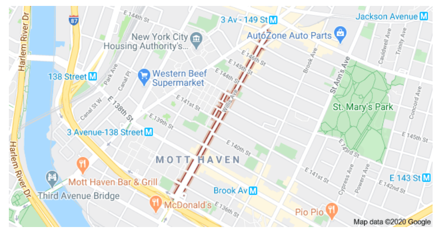
Fig. 1 Willis Avenue, The Bronx, New York City.

By or about 7:55PM at 136th between Brown Pl. and Brook Ave. the police announced a recorded dispersal order that coincided with the 8:00PM curfew. My partner and I were standing closer to Brown Pl. Individuals were not able to leave the scene to avoid violating the dispersal order and curfew without walking into the wall of riot police blocking access to Brown Pl. Simultaneously, the NYPD bike patrol also made a wall along 136th St. blocking demonstrators and our path to exit the scene. Once the dispersal order was given we were trapped and had no clear path to leave.