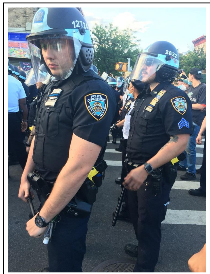
Intentionally obscured badge numbers on two officers and glimpses of the commanding officers to whom the public pointed them out.