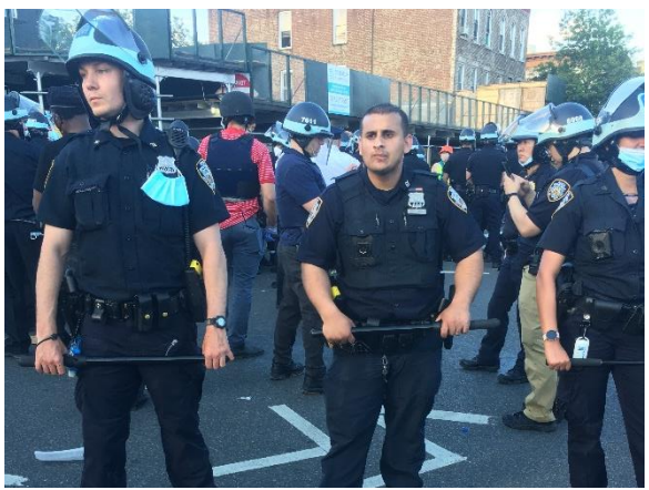
An intentionally covered name (L) and lack of mask (C). Minutes later the officer in the middle accepted a mask from a protestor - and was ridiculed by his colleagues for it.