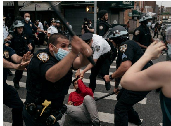
A familiar face spotted in news coverage the next morning.

We hear civilian leadership plea with officers to "do better" <sup>10</sup> – and see with our own eyes see more of the same. I am not a radical. I have spent my career in the public sector, and the last 5 years working with agencies within New York City to identify and advance incremental changes needed to better achieve their strategic objectives. <sup>11</sup> It has become clear to me that this approach to reform will not work when it