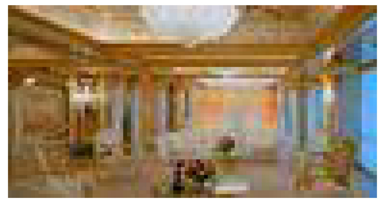
Donald Trump's living room.

No Trump spokesperson would comment on any of this, so using the correct square footage, we estimate the president's pad is worth $64 million, less than a third of his number.