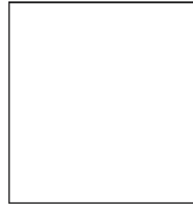
Right index fingerprint of alien removed

(Signature of alien being fingerprinted)