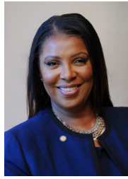
New York State Attorney General Letitia James