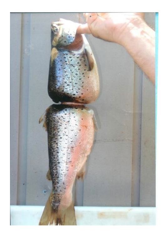
A rainbow trout, a species that also inhabits the Buffalo River, captured in Lake Ontario deformed by a plastic bottle ring.

on the Buffalo River or its tributaries and are commonly eaten by humans and other animals.