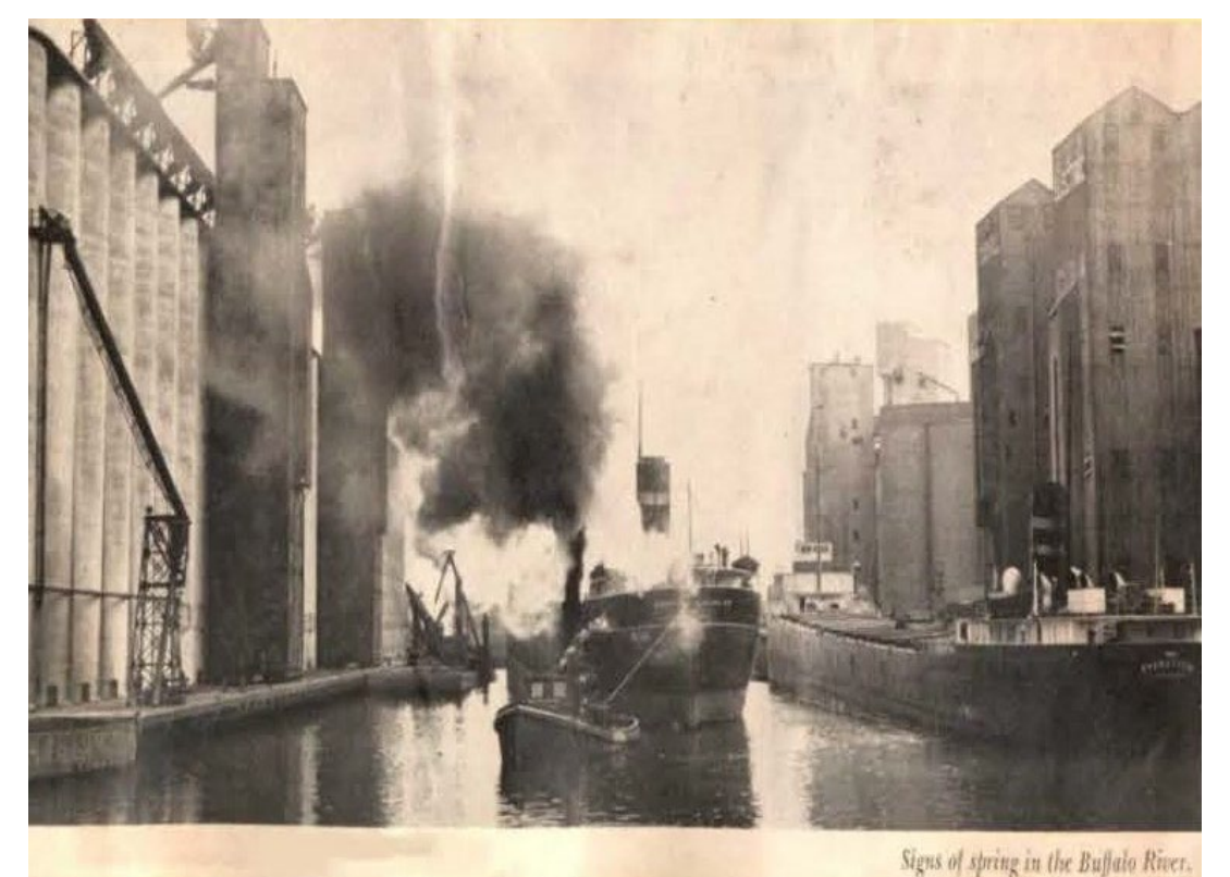
The Buffalo River in April 1951.

30. The Buffalo River was once considered one of the most polluted rivers in the United States. Discharges from grain milling and manufacturing industries that operated along the river in the late 1800s and at the turn of the century, along with chemical and sewer discharges, had so polluted the river that it was devoid of fish by the 1920s. Extensive dredging to deepen and widen the river for navigation during this time also damaged the river's ecosystem. As late as the 1960s, the river was considered biologically dead.