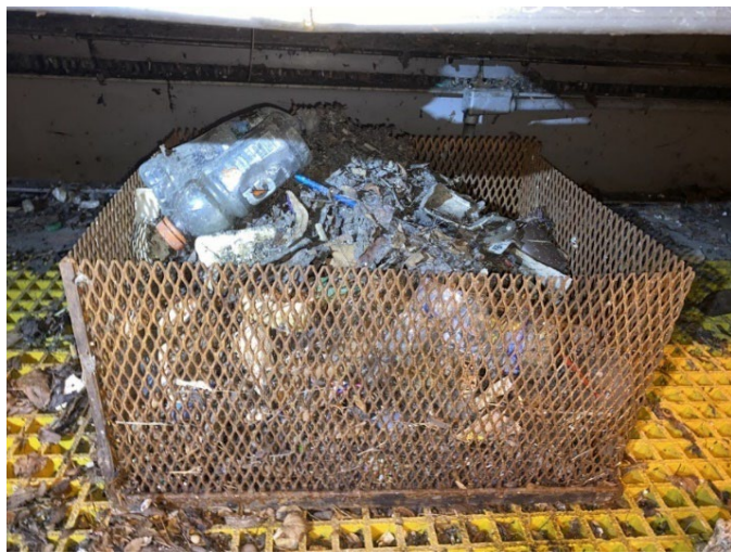
Gatorade plastic bottle on the conveyer belt at the Hamburg Drain Floatables Control Facility, observed December 14, 2022.