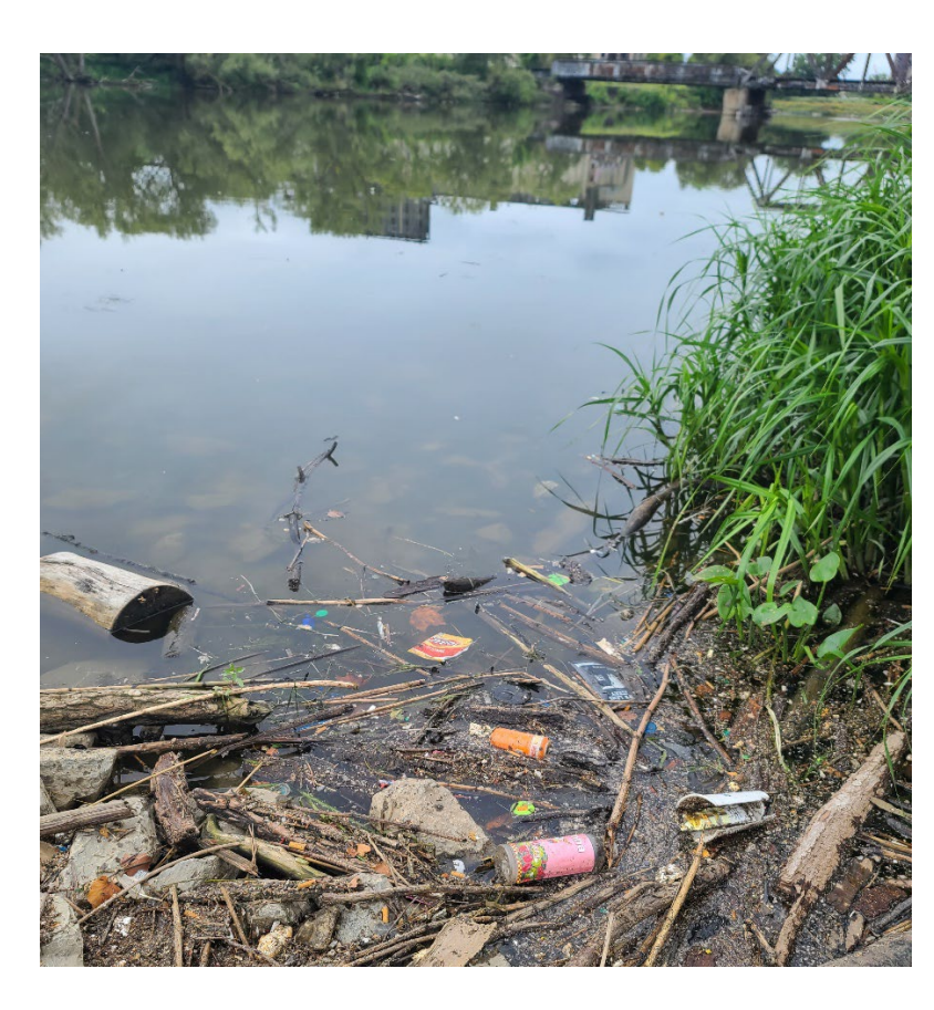
Plastic pollution, including a Fritos snack wrapper produced by PepsiCo, on the shoreline of the Buffalo River at Red Jacket Natural Habitat Park. Observed September 8, 2023.

78. To counter the negative effects of plastic pollution, and in the face of PepsiCo's failure to abate the harms caused by plastic pollution, the public has undertaken costly measures to reduce the quantity of plastic pollution in and around the Buffalo River. For instance, as a part of the redevelopment of Buffalo's Inner Harbor, the Buffalo Sewer Authority was awarded $8.6 million in funding through the American Recovery and Reinvestment Act to support the construction of the Hamburg Drain Floatables Control Facility, estimated to cost $18 million. This facility is designed to capture floatable waste, a significant portion of which is plastic pollution, from twenty sewer regulators within the Hamburg drain system before it gets to Canalside, a newly created and popular tourist destination at the mouth of the Buffalo River.