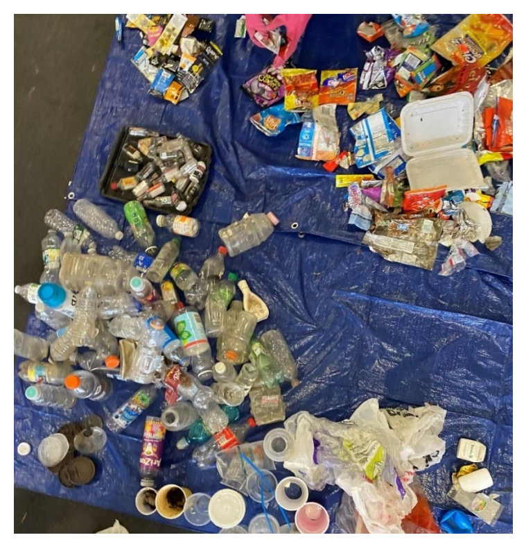
Plastic waste collected in April 2022 from the Erie Basin Marina in the City of Buffalo, including Gatorade bottles and Lay's potato chip packaging produced by PepsiCo.

1. Year after year, plastic packaging amasses on the shores of the Buffalo River. Single-use plastic beverage bottles, bottle caps, and snack food wrappers, of the type manufactured, distributed, and sold by PepsiCo, are collectively the most abundant forms of plastic waste along the shores of the Buffalo River, and PepsiCo is the single largest identifiable contributor to this plastic waste.