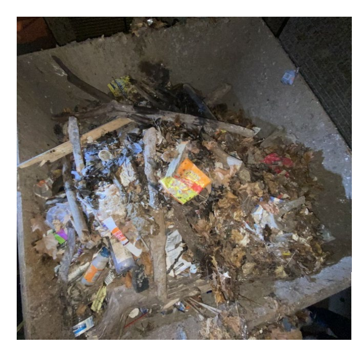
Cheetos snack wrapper in the hopper at the Hamburg Drain Floatables Control Facility, observed December 14, 2022.

79. The accumulation of single-use plastic waste in the Buffalo River, to which PepsiCo substantially contributes, is also a factor in the ongoing need for the Hamburg drain system, constructed and operated at great public expense. Nearly half of branded trash items observed during two site visits to the Hamburg Drain Floatables Control Facility were plastic beverage bottles or plastic snack food wrappers produced by PepsiCo.