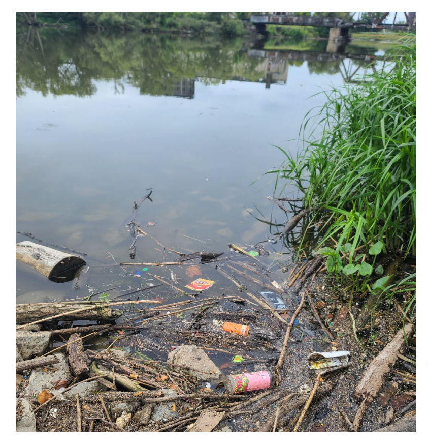
Plastic pollution, including a Fritos snack wrapper produced by PepsiCo, on the shoreline of the Buffalo River at Red Jacket Natural Habitat Park. Observed September 8, 2023.

78. To counter the negative effects of plastic pollution, and in the face of PepsiCo's failure to abate the harms caused by plastic pollution, the public has undertaken costly measures to reduce the quantity of plastic pollution in and around the Buffalo River. For instance, as a part of the redevelopment of Buffalo's Inner Harbor, the Buffalo Sewer Authority was awarded $8.6 million in funding through the American Recovery and Reinvestment Act to support the construction of the Hamburg Drain Floatables Control Facility, estimated to cost $18 million. This facility is designed to capture floatable waste, a significant portion of which is plastic pollution, from twenty sewer regulators within the Hamburg drain system before it gets to Canalside, a newly created and popular tourist destination at the mouth of the Buffalo River.