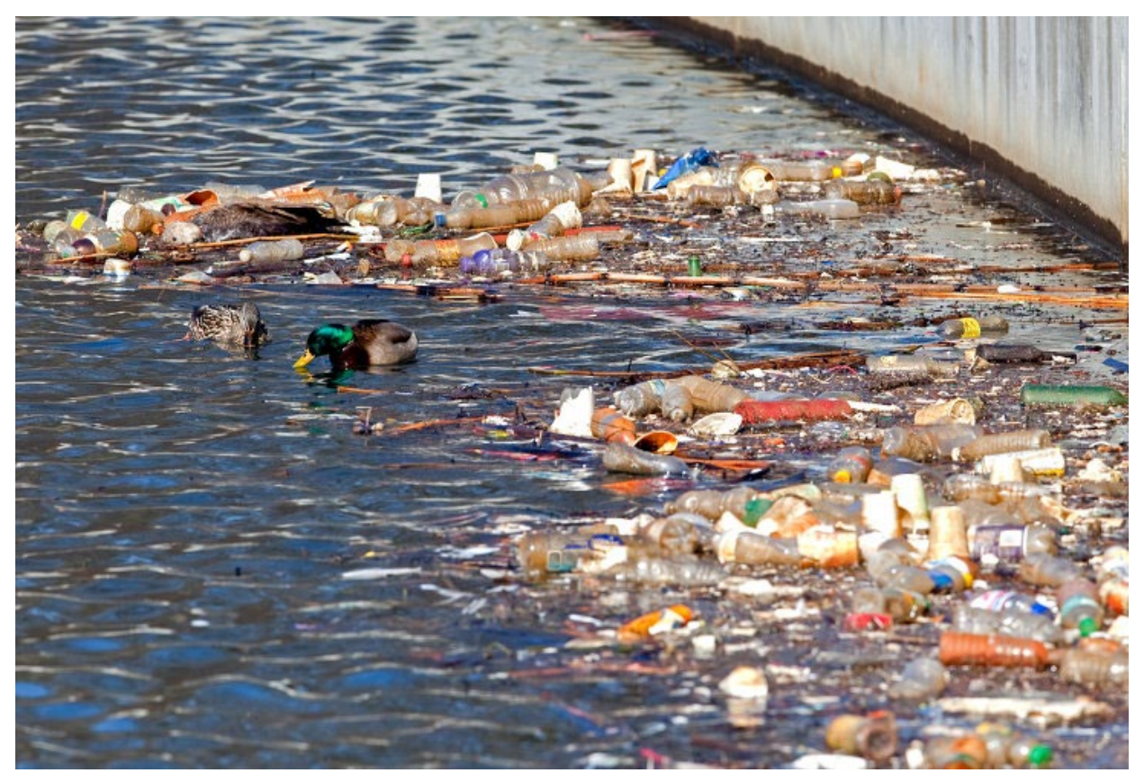
Mallard ducks feeding in a mass of floating waste.

71. Birds that inhabit the Buffalo River and its environs, such as mallard ducks, loons, and cormorants, are known to ingest plastic pollution, mistaking it for food. As a consequence, they can suffer from weakness, irritation of the stomach lining, digestive tract blockage, internal bleeding, abrasion, ulcers, failure to put on fat stores necessary for migration and reproduction, absorption of toxins, and even potential death through starvation.