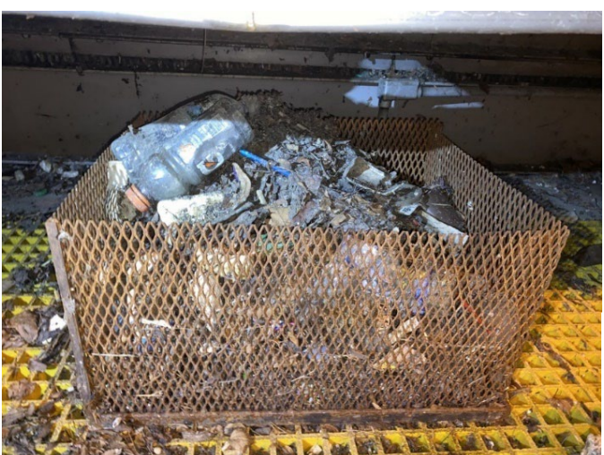
Gatorade plastic bottle on the conveyer belt at the Hamburg Drain Floatables Control Facility, observed December 14, 2022.