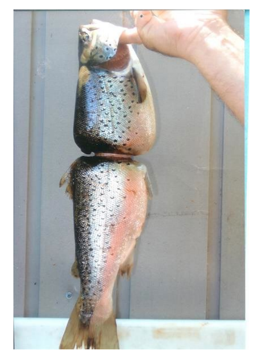
A rainbow trout, a species that also inhabits the Buffalo River, captured in Lake Ontario deformed by a plastic bottle ring.

on the Buffalo River or its tributaries and are commonly eaten by humans and other animals.