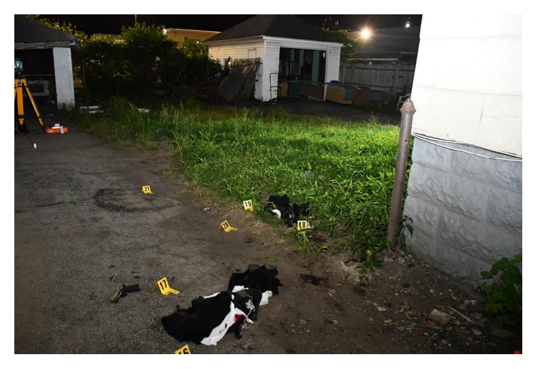
Photograph of the southeast Corner of 955 Avenue D after the shooting. The recovered firearm is on lower left (#17) and the fired cartridge case is on the middle left (#21).