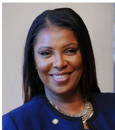
Attorney General Letitia James

Face scrubs, body washes, even some toothpastes include tiny plastic microbeads that enter the wastewater stream and end up in our lakes and streams. My office's Environmental Protection Bureau is working to ban microbeads from personal care products.