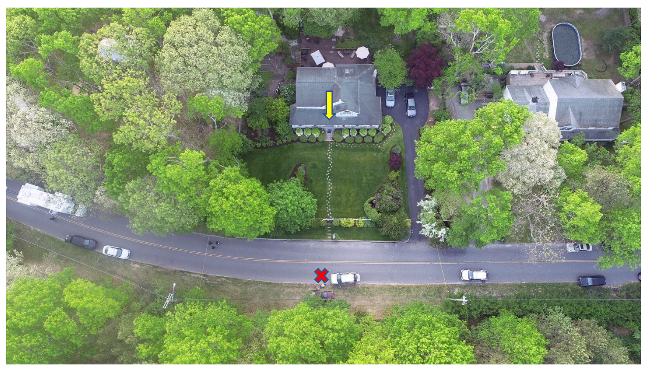
The yellow arrow indicates the front door of 67 Bauer Avenue, where Ring camera video was obtained. The red x indicates the location of the shooting. The maroon-colored car is Mr. Bonsignore's car, and the white car is Officer Skidmore's police car.

The shooting occurred in Suffolk County, across the street from the house at 67 Bauer Avenue, Manorville, New York. Bauer Avenue is a residential street, and there is a grassy, wooded area across the street from 67 Bauer Avenue.