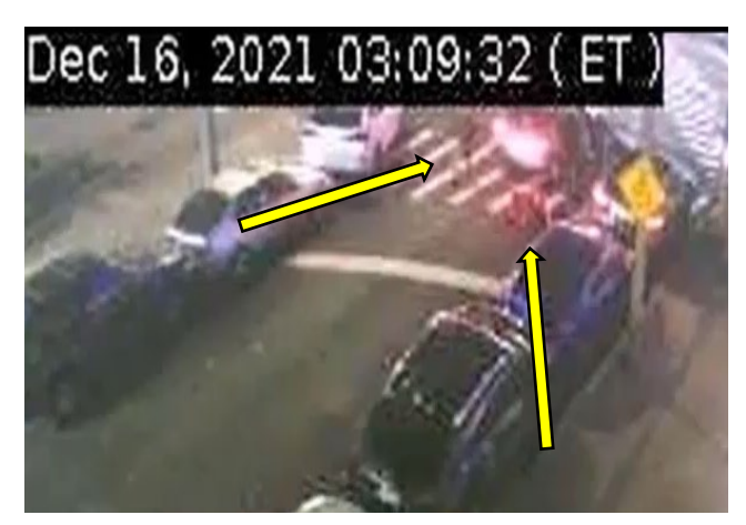
Two persons running away from Lt. Yakubov's car