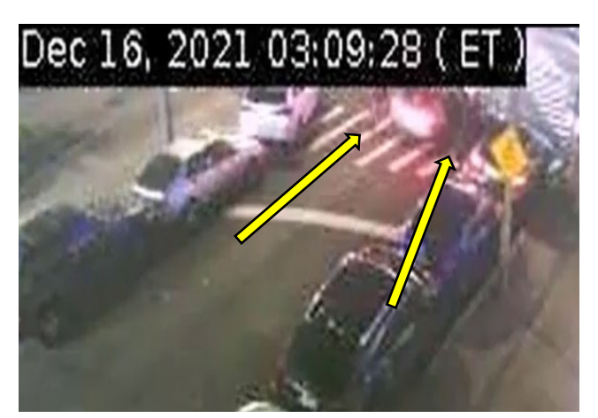
Two persons exit the sedan and approach Lt. Yakubov's car