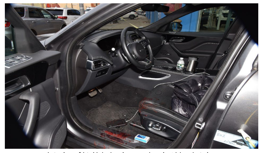
Interior of Lt. Yakubov's car, showing blood stains