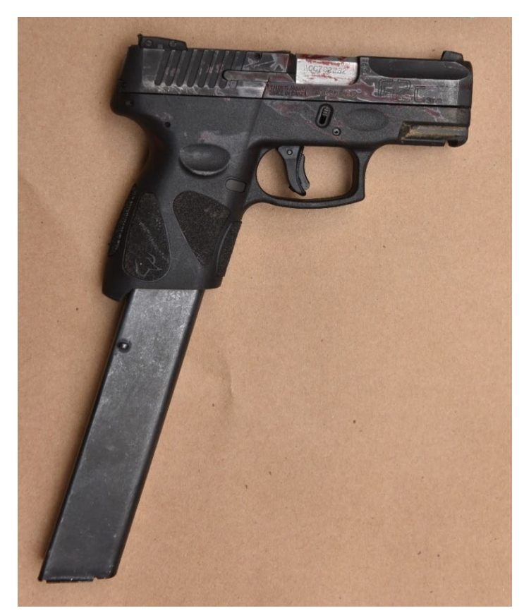
Mr. Lopez's weapon with extended magazine