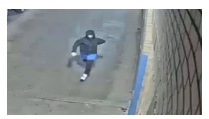
C.C. running south on 57 Street<sup>21</sup>