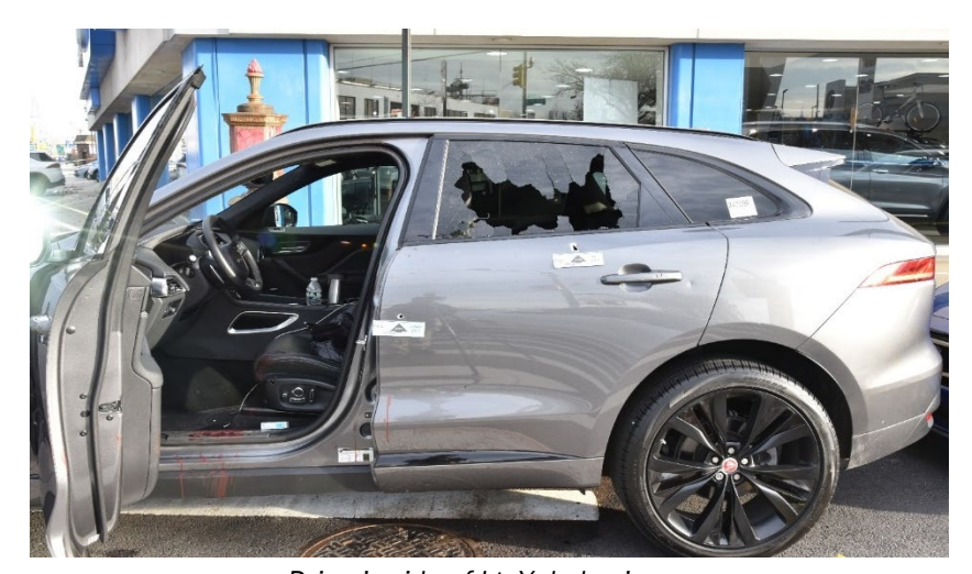
Driver's side of Lt. Yakubov's car