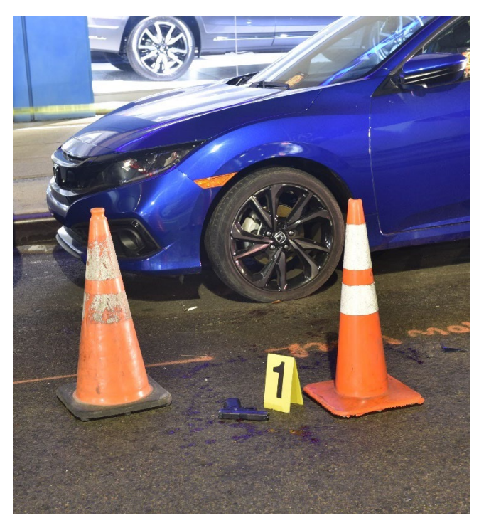
Lt. Yakubov's service weapon