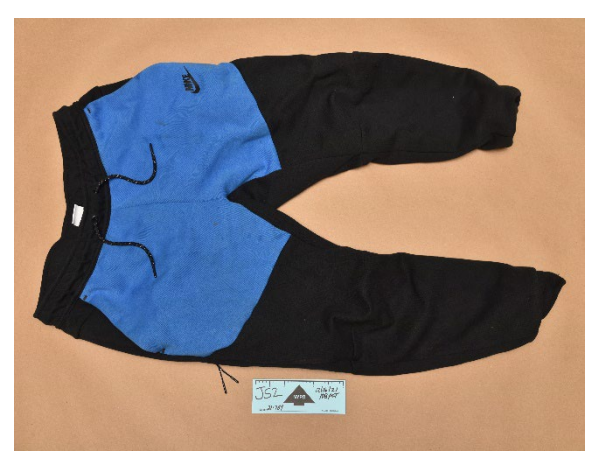
C.C.'s Black and Blue Sweatpants