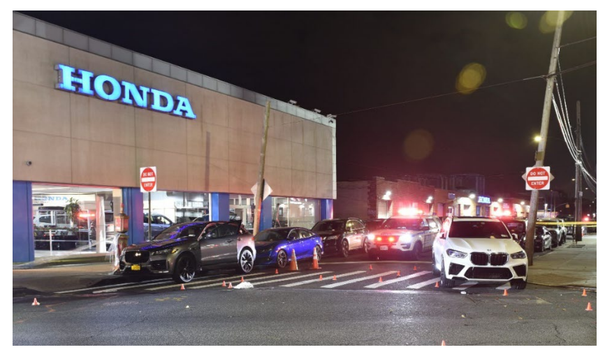
Southern crosswalk at the intersection of 57 Street and Northern Boulevard showing Lt. Yakubov's car on the left and the white BMW on the right