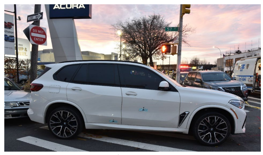
Damage to passenger side of white BMW parked near the shooting