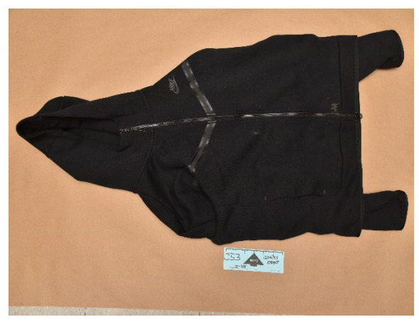
C.C.'s Black Hoodie Sweater