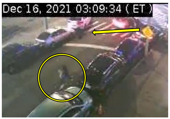
Two persons running away from Lt. Yakubov's car (Cruz circled)