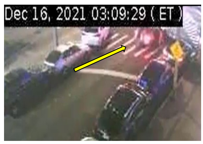
Third person exits the sedan and approaches Lt. Yakubov's car