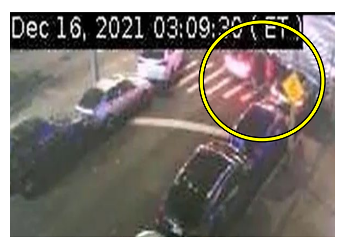
Three persons standing next to Lt. Yakubov's car's open door