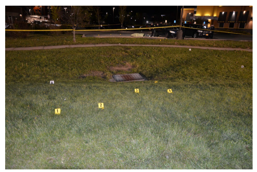
Crime scene photograph of ballistic evidence shown by numbered yellow flags, and the bodies under the yellow covering in the parking lot.

OSI canvassed for video in the surrounding area. OSI went to the Buffalo Wild Wings to request relevant video and was told the surveillance system was not working; the Buffalo Wild Wings