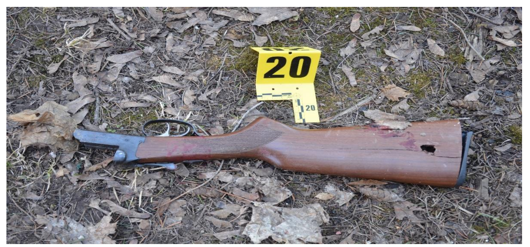
Crime scene photograph of the shotgun stock with possible blood found near the body of Mr. Burns in the backyard of 224 Barrington Street.