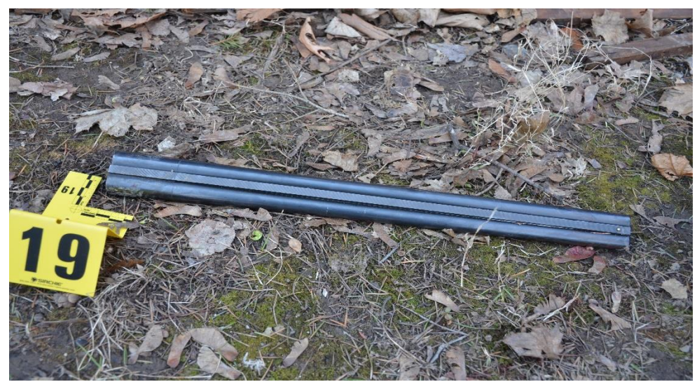
Crime scene photograph of the shotgun barrel found near the body of Mr. Burns in the backyard of 224 Barrington Street.