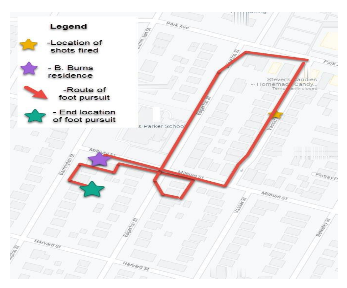
Map showing the foot pursuit of Mr. Burns. Mr. Burns's house was at the spot marked by the purple star. The final shots were fired at the spot marked by the green star.

The incident was captured on Deputy A. Baker's BWC, two home video security cameras, and police radio transmissions. OSI has created a composite video from the cameras and the audio recordings, accessible at the link in the footnote.<sup>2</sup>