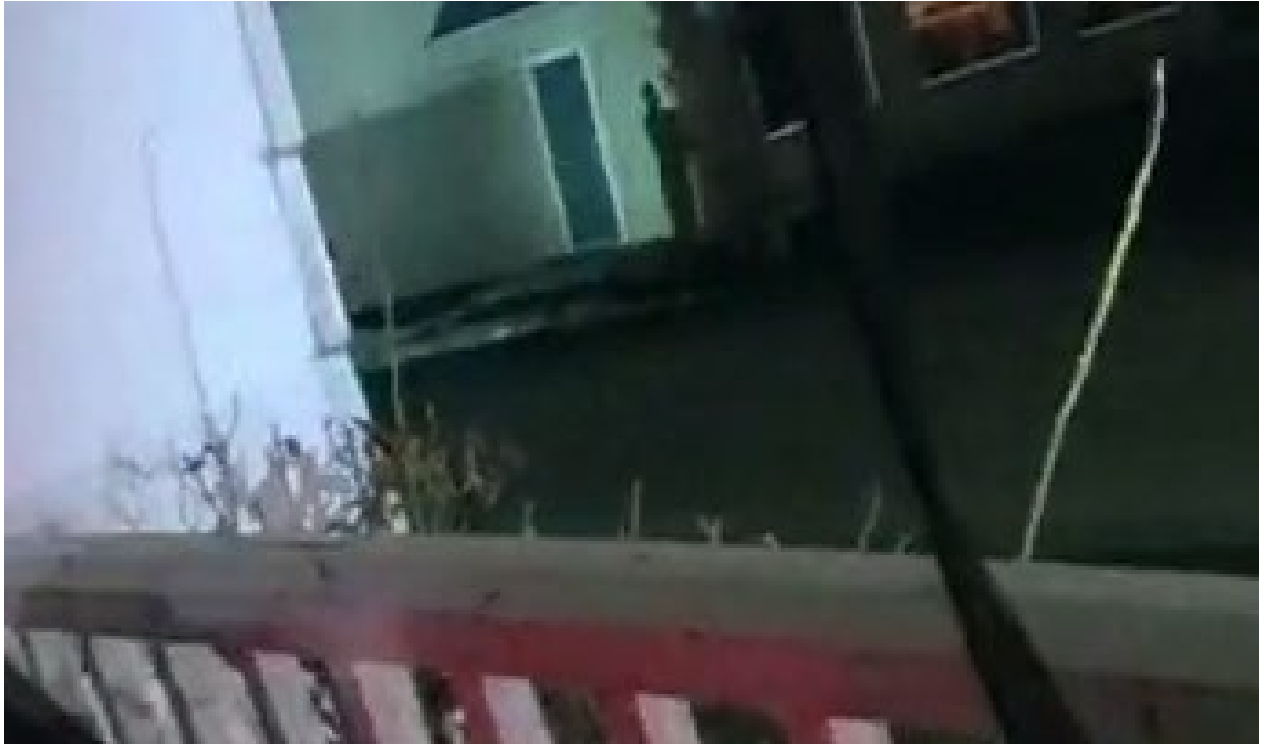
Zoomed still from Deputy Smith's BWC showing Mr. Zurkan's shadow.