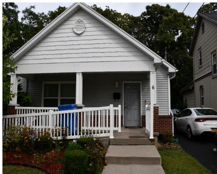
6 Vinewood Place on September 15, 2021. Dedrick James's 2013 White Dodge Dart is in the driveway on the right.

Consistent with these protocols, on September 15, 2021, fourteen members of the Task Force arrived at 6 Vinewood Place to arrest Mr. James.