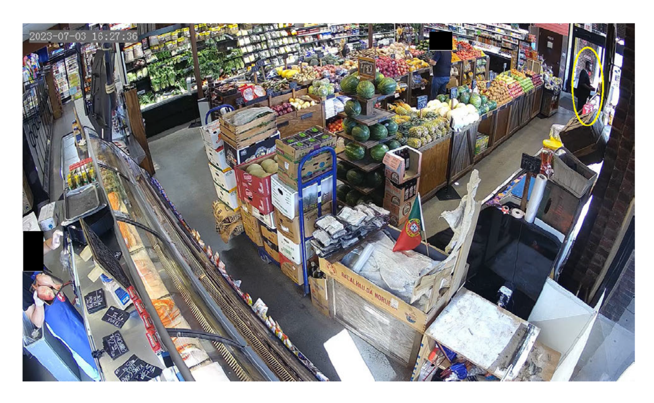
Mr. Garris circled in yellow eating produce